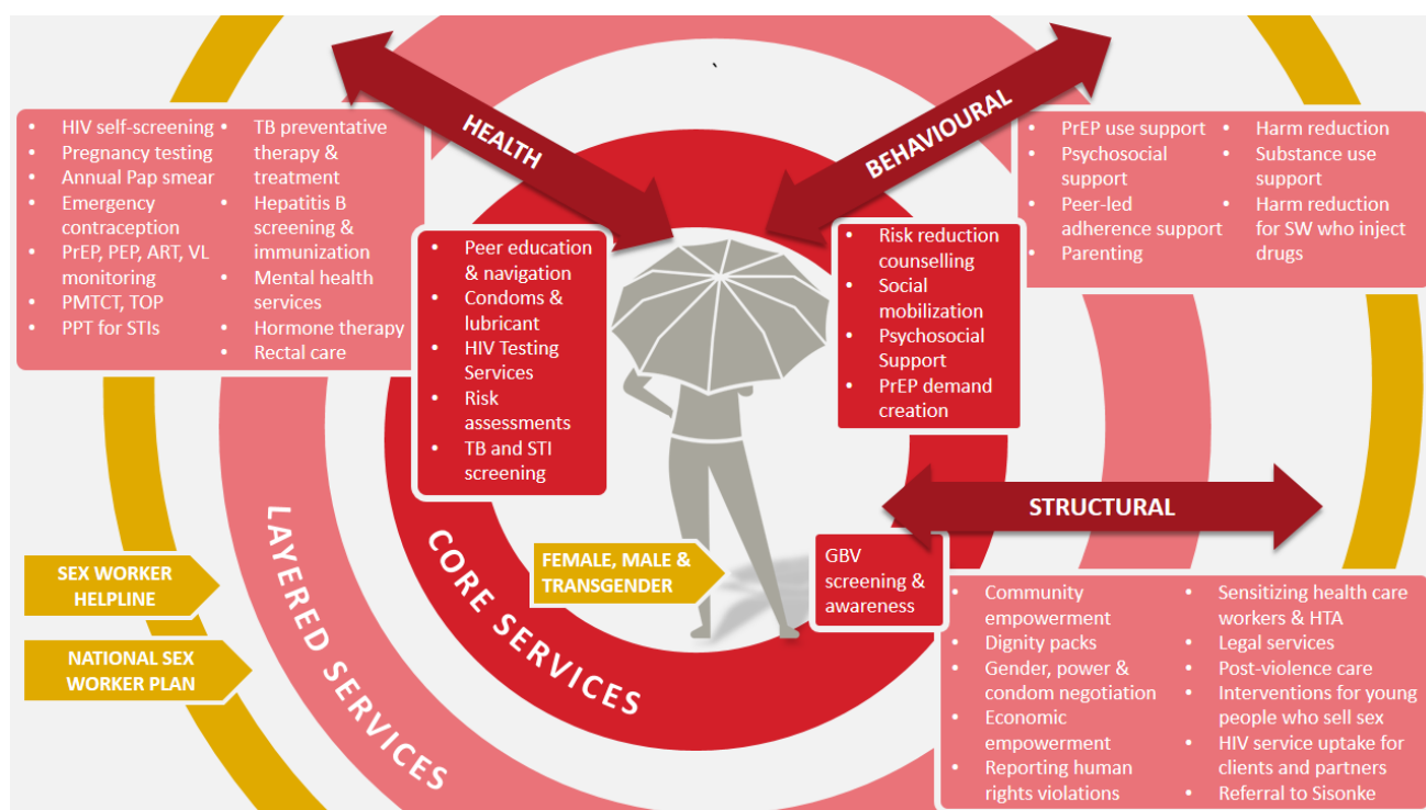
Figure 2: Graphic description of SW Programme

The programme is peer led reaching male, female and transgender sex workers. It seeks to provide individual rights-based services on the micro level through a package of core and layered services, including peer education, social mobilisation, and recruitment of sex workers to access a package of primary health care services, including HTS, screenings, condom and lubricant distribution. Other services also include psychosocial support, human rights support economic empowerment. The programmes seeks to promote sex worker and community empowerment alongside community and organisational level interventions which support the structural interventions. The structural interventions include sensitising stakeholders, capacitating organisations and promoting networks and linkages between sex workers and stakeholders/community.