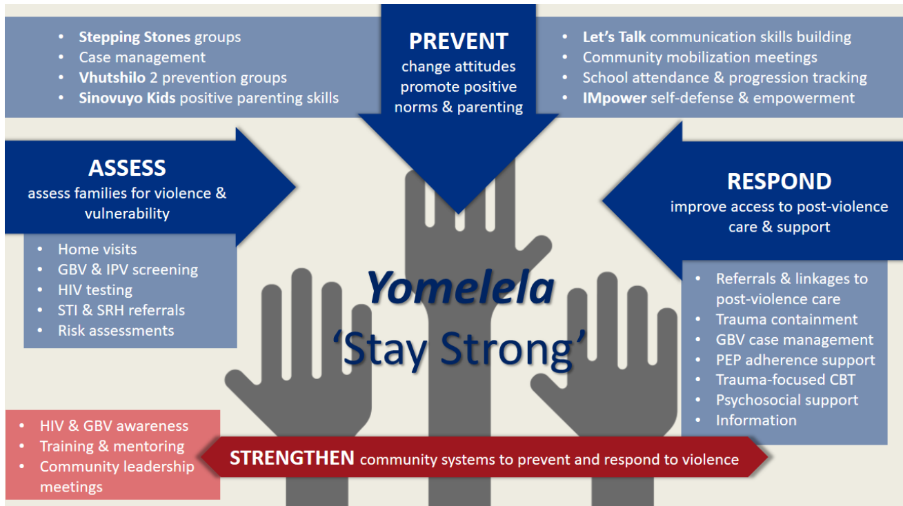
Figure 1 Programme summary

As part of this programme, NACOSA is looking for implementing partners working with Orphans and Vulnerable Children and Youth (OVCY) and Gender-Based Violence (GBV) survivors, or both, in eThekweni District of KwaZulu-Natal, specifically those working in the North, South and West Sub-Districts.