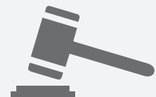
IZINKANTOLO ZAMACALA APHATHELENE NEZOCANSI

Umqondo wezinkantolo zamacala aphilhelene namacala aphilhelene nezocansi wenziwa eNingizimu Afrika. Ngonyaka ka-2013, kwenziwa isibonelo senkantolo yamacala aphilhelene nezocansi, esho konke okudingekayo ukuthi inkantolo ibe yinkantolo yamacala aphilhelene nezocansi. Lesi sibonelo sidinga ukuthi lezi zinkantolo zibe nabashushisi abaqeqeshwe ngokukhethekile*, abasizi benkantolo kanye nezimantshi**. Inkantolo yamacala aphilhelene nezocansi inegumbi lenkantolo eliseceleni. Inegumbi futhi lokufakazela elinempahla ye-CCTV, lapho izingane zikwazi ukufakazela khona ngaphandle kokubhekana ngqo nomdlwenguli noma nomuntu owenze icala eliphathelene nezocansi, ngesikhathi zikhuluma ngalokho okwenzekile.