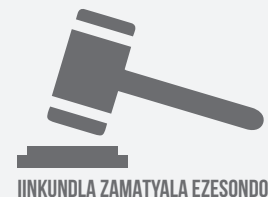
IINKUNDLA ZAMATYALA EZESONDO

Uluvo lweenkundla zamatyala ezesondo lwaphuhliswa eMzantsi Afrika. Ngo-2013, imodeli yenkundla yamatyala ezesondo entsha yaye yaphuhliswa, emisela yonke into efunekayo ukuba inkundla ibe yinkundla yamatyala ezesondo. Le modeli ifuna ukuba ezi nkundla zibe nabatshutshisi* abaqeqeshwe ngokukhethekileyo, abaxhasi benkundla kunye noomantyi**. Inkundla yamatyala ezesondo inegumbi lenkundla elahlukanisiweyo. Kananjalo inegumbi lokunika ubungqina elinezixhobo ze-CCTV, apho abantwana banokunika khona ubungqina ngaphandle kokuba bajongane nomdlwenguli okanye umoni buqu, ngexa bethetha ngento eyenzekileyo.